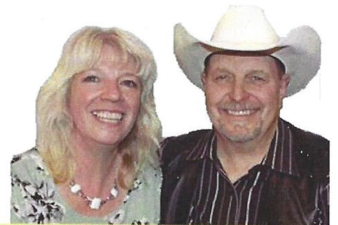
AMBASSADORS OF GRACE