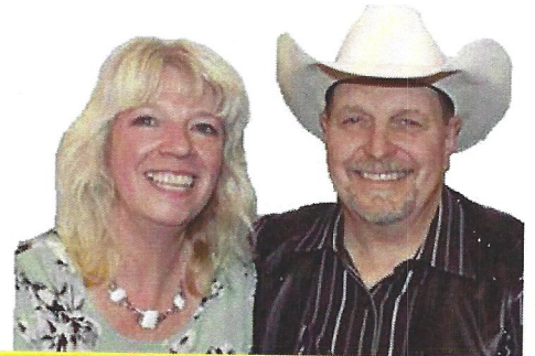
AMBASSADORS OF GRACE