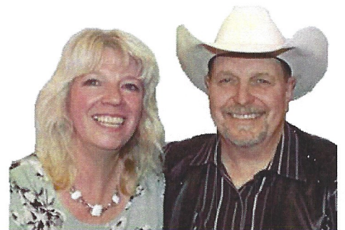
AMBASSADORS OF GRACE